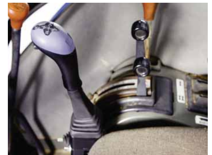
Fast and responsive joystick