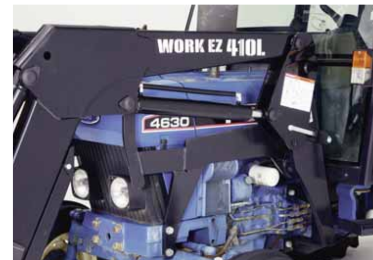
Quick Lock or Pin-On attachment for easy on-off

AGCO Landini AGCO Allis Massey AGCO White McCormick CIH Same Deere Valtra Duetz Zetor Kubota