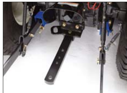
A two-position extendable drawbar is standard equipment to make attaching implements easy.

mate for multiple implements, including rear tillers and finishing mowers. On the front, you can attach a high-performance loader, snow blower or blade.