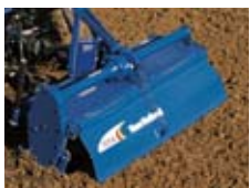
105A Rotary Tillers