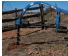
906 Posthole Digger