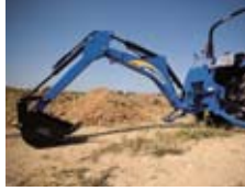
920GH, 930GH Backhoe