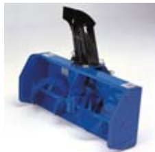
51CS/63CS Quick Hitch Front-Mount Snow Blower