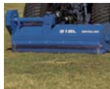
918L Flail Mower