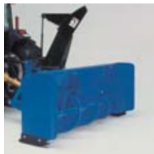
64CSR and 74CSR Rear Two-stage Snow Blowers