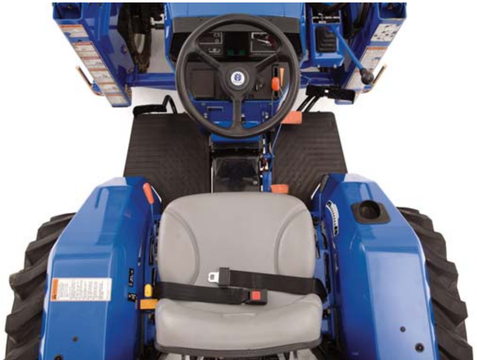
The operating controls and instrumentation on the T1500 Series are convenient, straight-forward and refreshingly simple. The comfortable contoured seat glides on an inclined track to put you in the perfect operating position.

Step onto the spacious operator platform and you'll appreciate the lack of clutter and the simple, straightforward instrumentation. The 9 x 3 gear transmission controls are on the dash, not the floor, so the deck is wide open. It's easy on... and easy off. The standard anti-slip rubber floor mat prevents dust from coming through to help keep the platform clean. A well-padded, contoured seat glides on an inclined track to place you at exactly the right spot to operate comfortably. There's even a handy cup holder provided for you on the fender. You'll also appreciate the view. The muffler is under the hood—not in your line of sight. A standard foldable ROPS allows for convenient storage in low-clearance areas or driving under low overhangs when necessary.