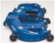
914A Mid-Mount Mower