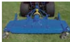
310 and 320 Rear Finishing Mowers