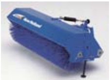
60CO and 72CO Quick Hitch Front-Mount Rotary Broom