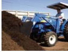
110TL Front-end Loader