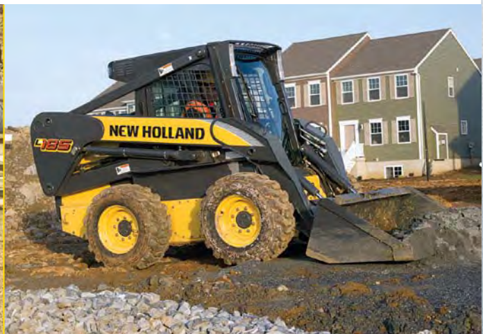
L185 is shown with the bucket attachment.