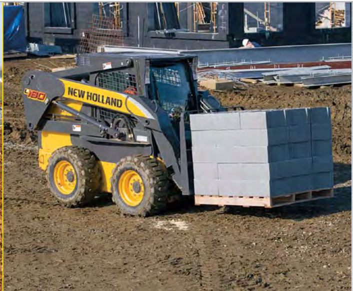
L180 is shown with the pallet fork attachment.