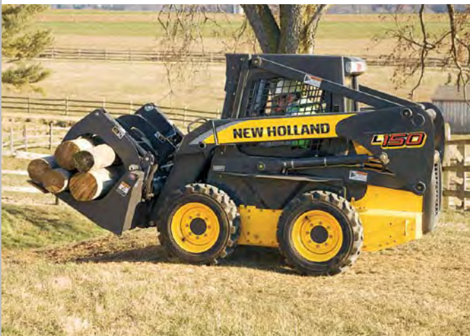
L150 is shown with the grapple attachment.