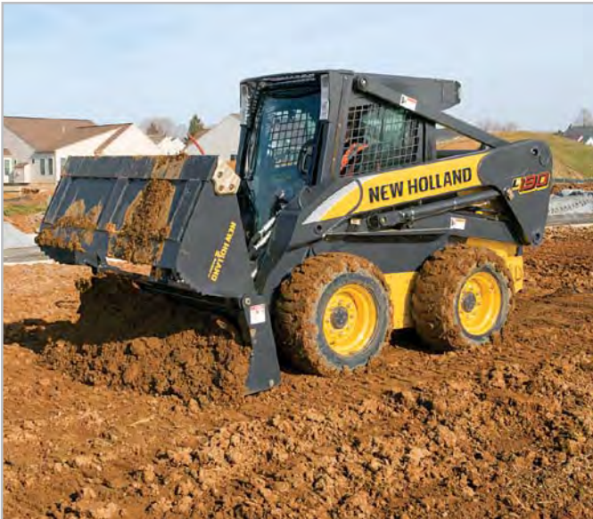
L190 is shown with the 4x1 bucket attachment.