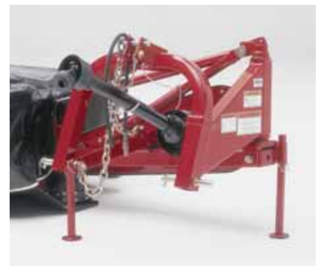
Two parking stands make tractor attachment and removal easy.