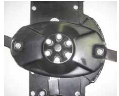
The enclosed gear-driven cutterbar uses two high-quality steel knives on each low-profile, oval disc to produce a fast, clean cut. The discs are retained with six bolts for easier service.