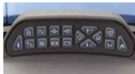
An enhanced performance monitor and radar are optional on all Plus and Elite models, allowing you to track and program a variety of functions including linkage height, PTO speed, hours, distance traveled and electronic remote valve status.