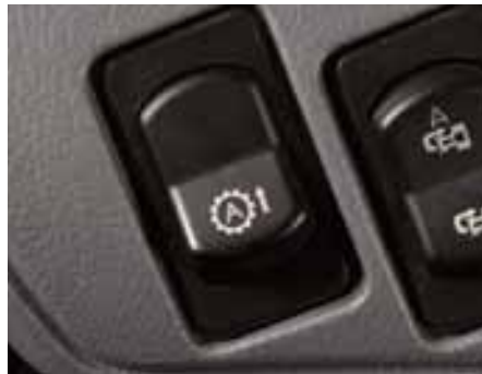
Just press the "Auto" button, and the Power Command™ transmission automatically shifts up or down within a span of gears based on engine RPM and applied flywheel torque.