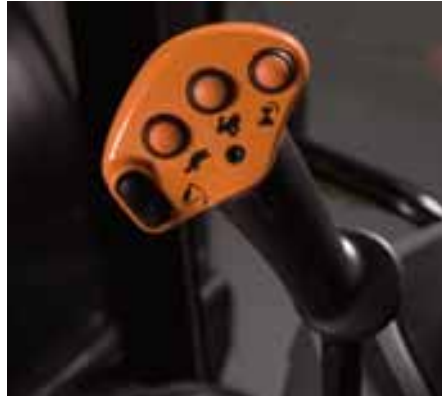
The convenient seat-mounted multi function controller gives you complete transmission control on Power Command equipped models.

A 19x6 Power Command™ transmission provides an additional forward speed that allows T6000 Elite tractors to achieve a higher 31-mph (50-kph) speed (tire restrictions apply).