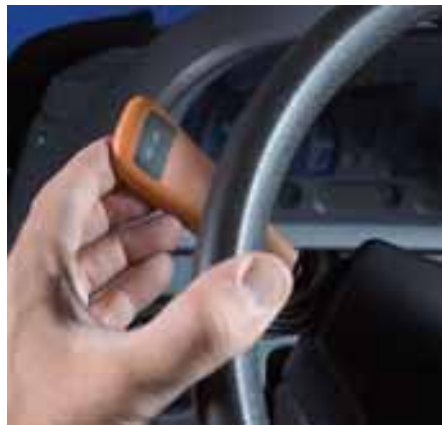
The clutch-free power shuttle is electro-hydraulically engaged and located to the left of the steering column for easy fingertip control.