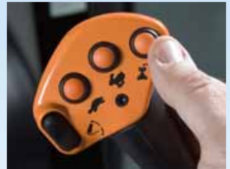
Switches on the right-hand console are used to alert the system that you are ready to record (A) or play back (B) a sequence of actions. Then, press the “step” button to actually activate the recording or playback. The step button is located on the multi-controller (C) on Elite six-cylinder models, and on the seat-mounted electronic draft control mouse on Elite four-cylinder models.