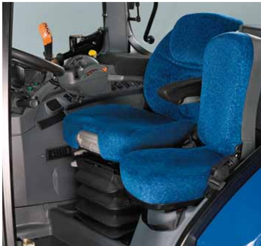
A comfortable, supportive, full-size instructor seat is a Horizon cab option.

For the absolute smoothest ride over bumpy ground, choose the Comfort Ride™ Cab Suspension option available on Plus and Elite models. This simple mechanical system is always on. Two isolation "donuts" at the front corners of the cab and a swaybar and two shock absorbers at the rear isolate you from up-down motions and side-to-side swaying.