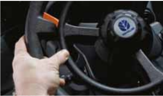
To engage FastSteer, simply press on the inner ring of the steering wheel. The FastSteer system automatically disengages when travel speed exceeds 6.2 mph.