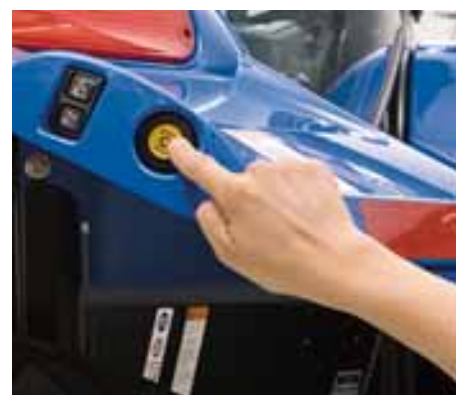
Quick-raise hitch switches are provided on both rear fenders on tractors equipped with electronic draft control. An exterior PTO switch is also provided on the rear fender of all cab models. Press the button for less than five second for a pulsing action that makes it easier to hook up the PTO shaft. Hold the button for longer than five seconds to fully engage the PTO.