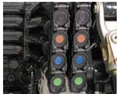
Hydraulic control levers and remote coupler dust covers are color-coded to assist with easy implement hook up and control.