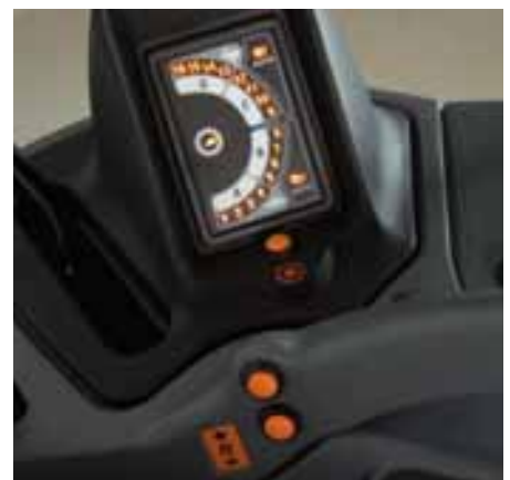
AutoShift™ transmissions provide automatic shifting in the field or one the road. You program the shift point and shuttle preferences.