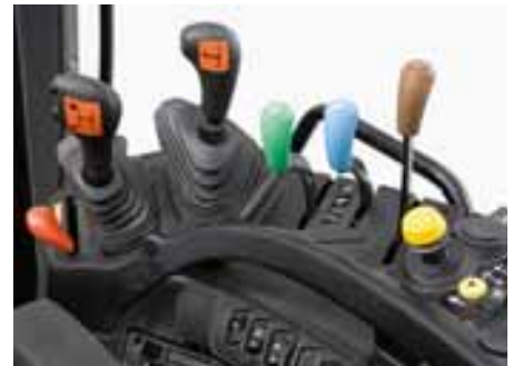
The 24x24 Dual Command transmission doubles your gears from 12 to 24. Underdrive button on the side of the shift lever and on the console (B) allows you to powershift on-the-go without clutching.

even more time-saving features. Push the “Auto” button while operating in the field, and the AutoShift transmission does the shifting for you within the four gears of Ranges A (Gears 1 to 4), B (gears 5 to 8) or C (Gears 9 to 12). When roading, press the AutoShift button once to shift as needed within Ranges C or D; press the AutoShift button twice to move freely from gear 9 through gear 16 and back down as needed without stopping to shift