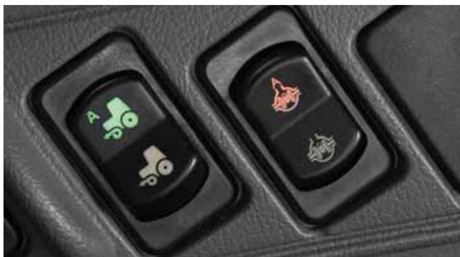
The TerraLock™ system automatically controls FWD and differential lock engagement to give you maximum traction and control.

Self-adjusting, self-equalizing hydraulic wet disc brakes deliver the stopping power you need. When both brake pedals are applied simultaneously, FWD engages automatically to aid in braking action for added control.